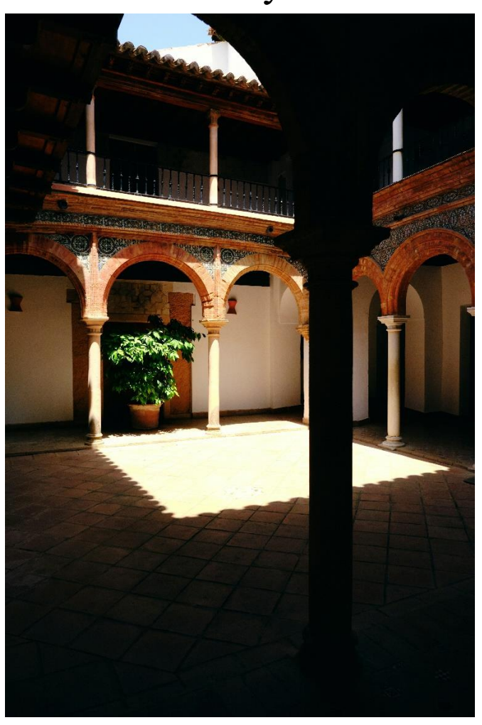
"Nourishing Faith and Community"