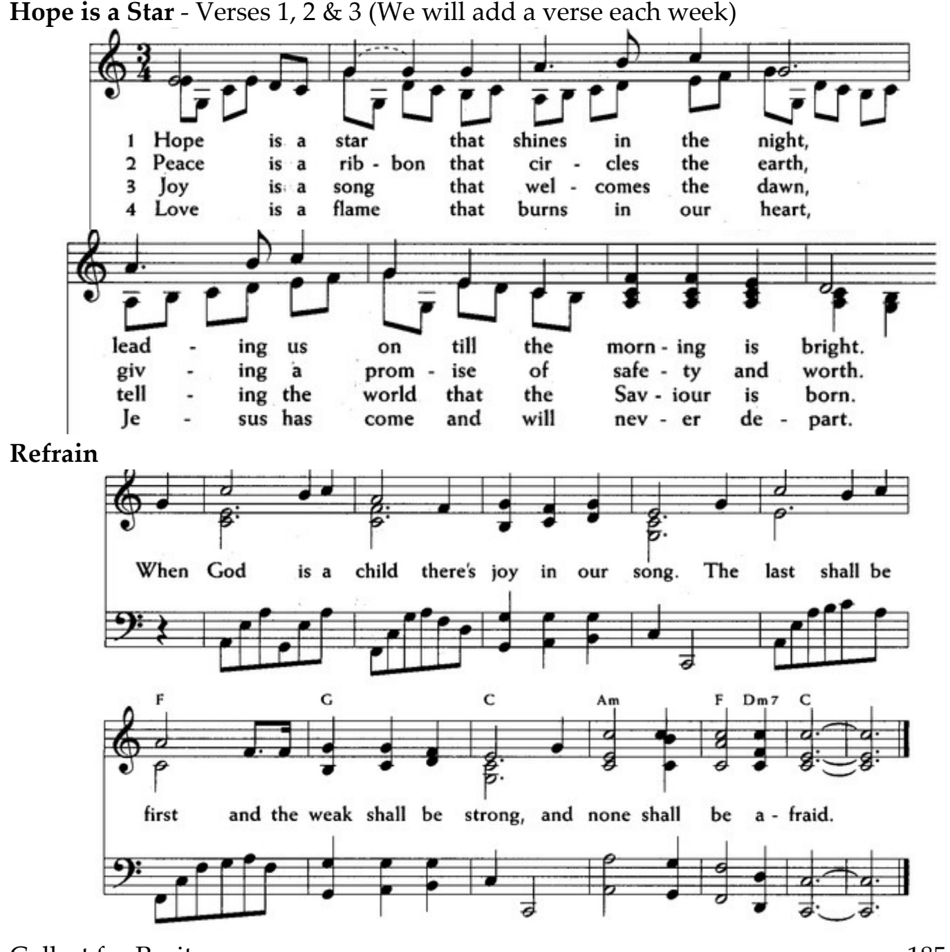
Hope is a Star - Verses 1, 2 & 3 (We will add a verse each week)