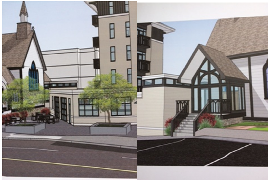
View from Esquimalt Road

We are excited about all the possibilities our new facility will provide for us in the foreseeable future. As we continue in this year, we will need to work together and support each other as changes happen on the road to fulfilling our ministry together. We will welcome a new Incumbent who will offer guidance and support as we grow together as a worshipping community. We thank God for all the good things which He has done for us!