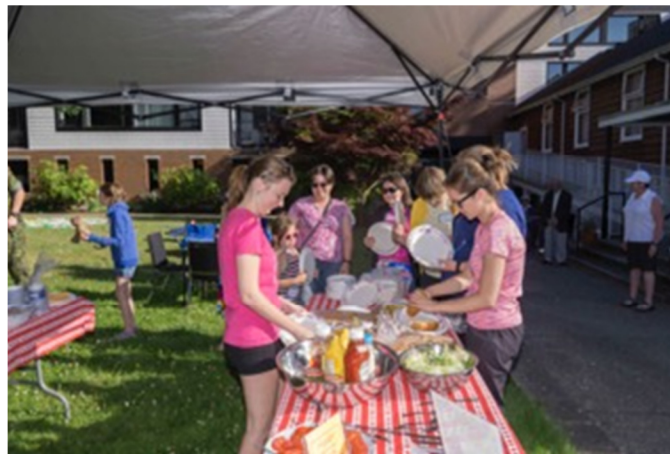
Military Family Resource Centre BBQ

Our Community Outreach donations and a Diocesan grant have allowed us to minister to our community through Christmas Hampers, dinners for the Military Family Resource Centre, and lunches for our 55+ neighbours as well as other outreach ministries. Some of our regular ministries may not be possible through the period when we are without a Parish Hall but others can continue. In addition, our Parish Council will ensure that these and new Community Outreach and Fellowship times are an integral part of our church family life. We will need volunteers to continue in these ministries.