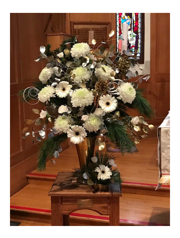
Chancel Guild Report

The Chancel Guild provides all the floral memorials at the altar each week as well as the decorative arrangements in the church for the main festivals of the year: Easter, Thanksgiving and Christmas.